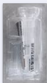
Saliva Collection Device